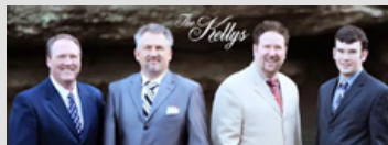
June 15 - The Kellys, in concert!