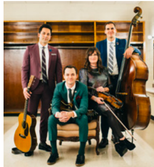
Act of Congress! Starting @7:30pm!