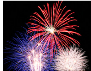
A Fireworks Spectacular! @9:00pm!